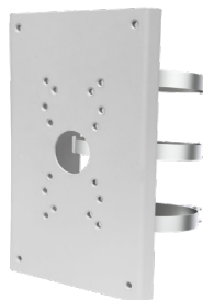
XLGNXPP1A8 - Pole Mount