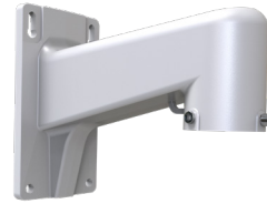
Wall mount for PTZ camera