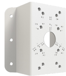
XLGNXPC1B5 - Corner Mount