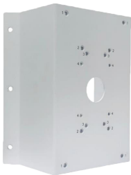
XLGNXPJM01 - Corner Mount (supports XLGNXPJ)