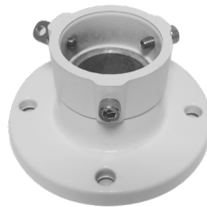
XLGNXC2A1 - Pendant Mount Bracket