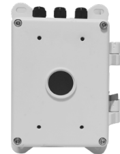
XLGNXPJ - Junction box with door and hinges