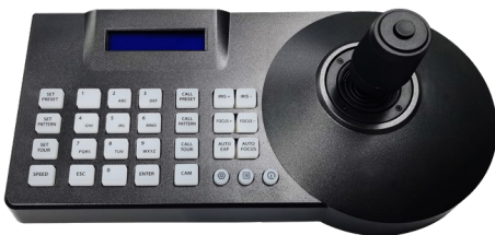
XLGNXKA3 - NX PTZ Keyboard

*Design and specifications are subject to change without notice - Version 2026-01-23