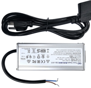
36 V power supply (with power cable)